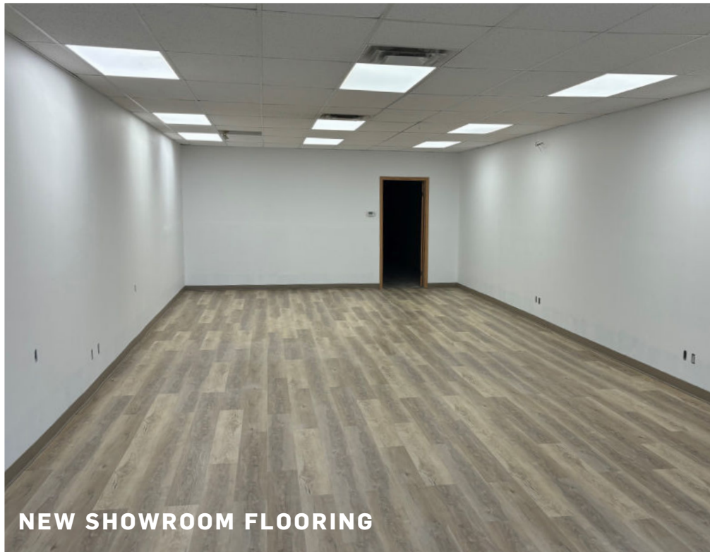
NEW SHOWROOM FLOORING